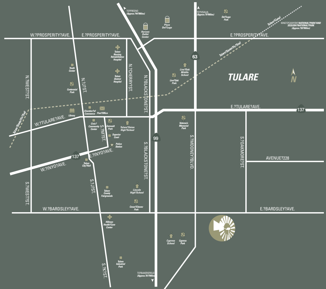
Map is artist's conception and not to scale.